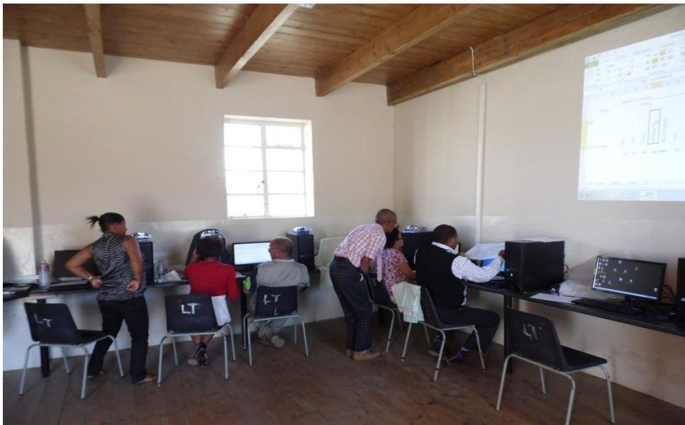
La Trobe teachers in session designing spread sheets

We are very happy and encouraged with the progress made by the teachers. All of them appear very confident end users. Most of them will be able to assist learners when they are introduced to the computers shortly.