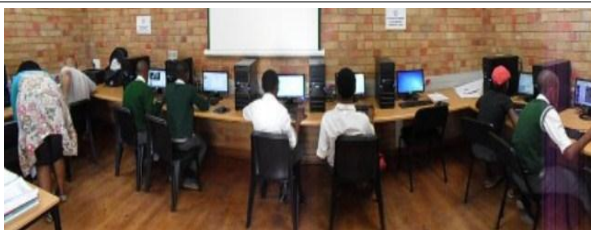
Sandisulwazi Computer room. Principal and HOD (far left) doing mark schedule design. Grade 10 learners surfing the web for information and doing Power Point presentations

Grade 11 and 12 learners regularly use the Khan Academy videos and CAMI software for revision. Overall the computer skills of the learners have accelerated and the computer room is always in use throughout the day and afternoons.