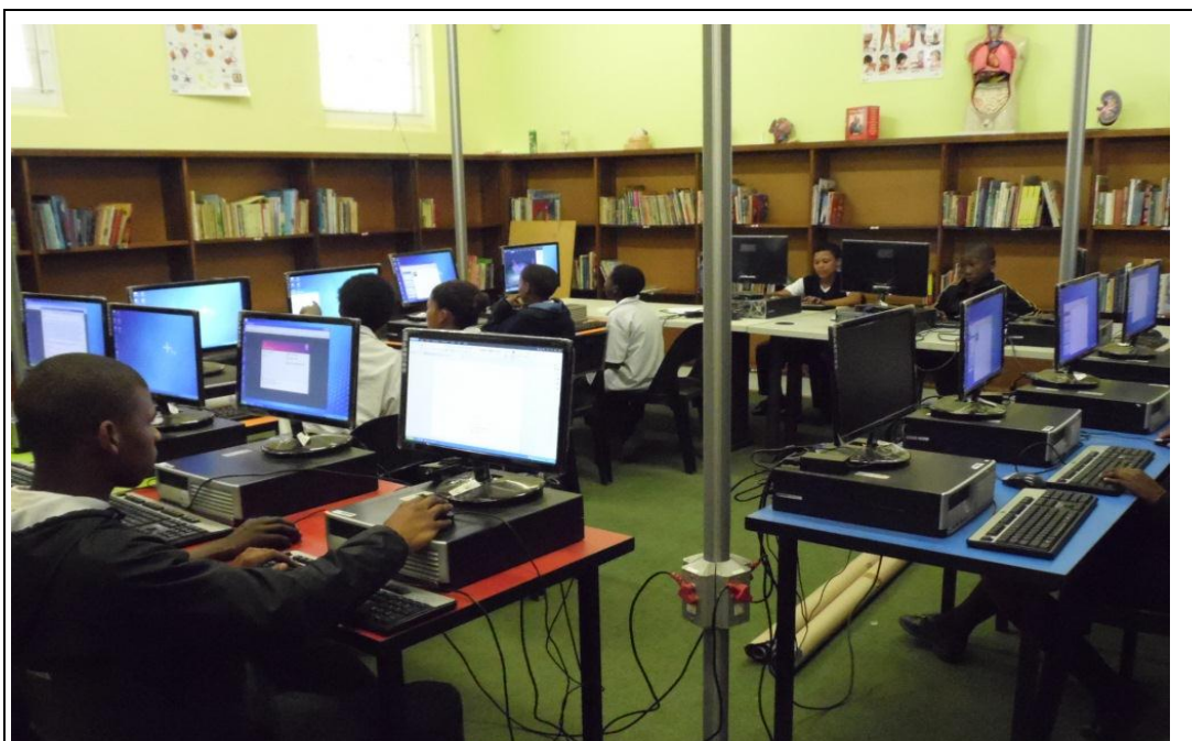
Rietberg Primary – Library/Computer room. Ready for teacher and learner training

The school will be included in the training and support program shortly. Current we are busy with setting up and preparing the computer room for teacher and learner use. The computers have been networked and software packages have been installed.